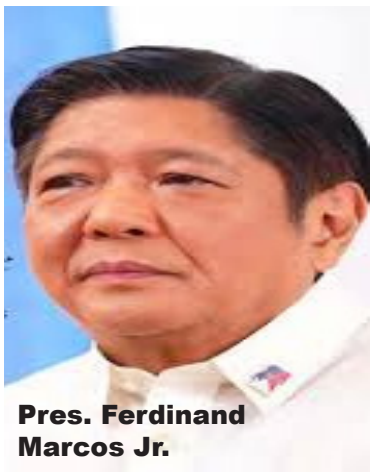
Pres. Ferdinand Marcos Jr.

Globe Telecom Inc. and Smart Communications Inc., the country's