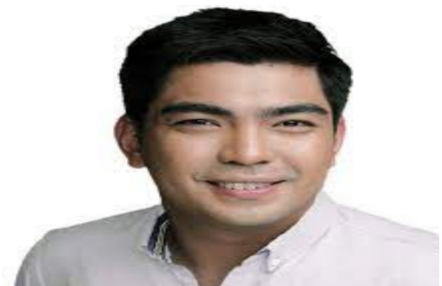
First District Representative Jolo Revilla

TRECE MARTIRES, Cavite (PIA) – The health officers of the local government units (LGUs) in the First District of the province convened for the first time with Cavite First District Representative Jolo Revilla to discuss plans for the district's health care system.