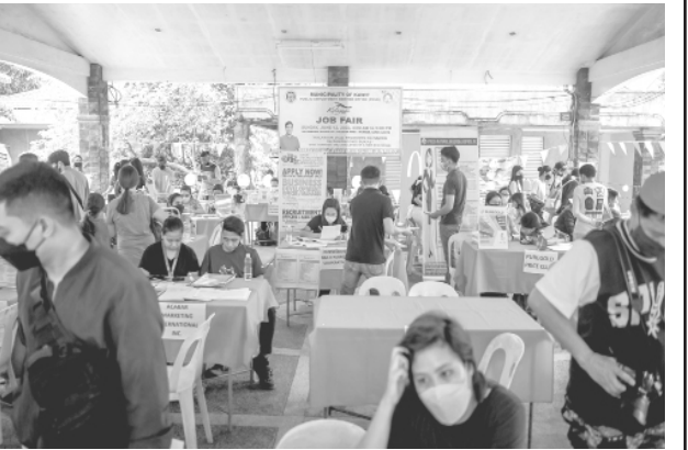
JOB FAIR in Kawit, Cavite

M a r a m i n g salamat po sa lahat ng nakiisa sa ating programa at good luck po sa mga kababayan nating sumubok at nag-apply!