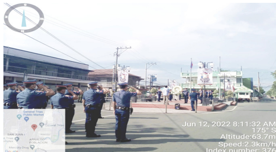
On June 12, 2022 at around 8:00 o'clock in the morning, in line with Enhance Managing Police Operation, personnel of this station conducted simultaneous Flag Raising and Wreath Laying rite, in relation to the celebration of the 124th Anniversary of the Proclamation of Philippine Independence with the theme: "KALAYAAN 2022": Pag suong sa Hamon ng Panibagong Bukas (Rise Towards the Challenge of the New Beginning)" held at General Trias Town Plaza, Brgy. Bagumbayan, General Trias City, Cavite.