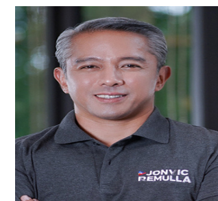
Cavite Governor Jonvic Remulla