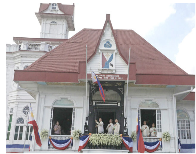
Flag-raising ceremony held in Kawit, Cavite for 124th Independence Day celebration