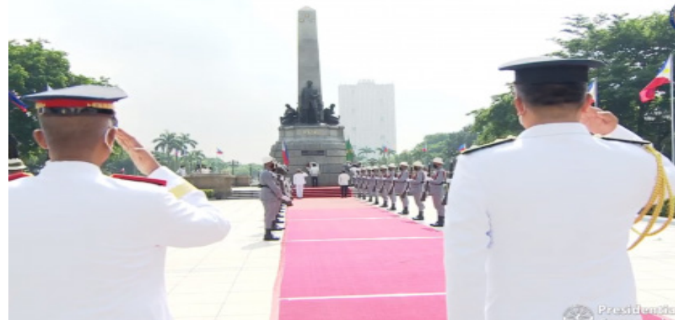
INDEPENDENCE DAY. President Rodrigo Roa Duterte leads the wreath-laying ceremony as part of the country's 124th Independence Day commemoration at the Rizal Park, Manila on Sunday (June 12, 2022). It was his last time to celebrate the occasion as his six-year term as the country's chief executive ends on June 30.