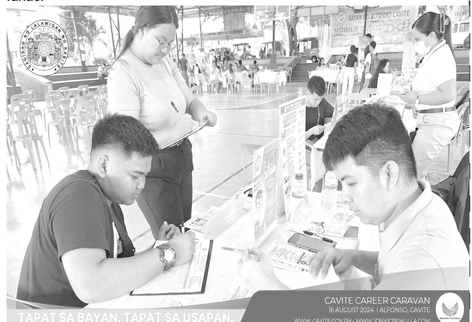
TAPAT SA BAYAN. TAPAT SA USAPAN.