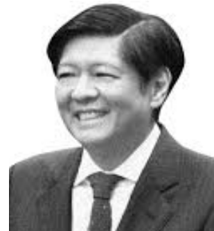
Pangulong Ferdinand R. Marcos, Jr.

Nagsimulang gugunitain ang mga bayaning Pilipino noong 1898 nang gawing pista opisyal ni Pangulong Emilio Aguinaldo ang 30 Disyembre upang maging araw ng pagluluksa para kay Jose Rizal at sa mga makabayang Pilipino na namatay sa pakikibaka laban sa mga Espanyol. Itinuring din