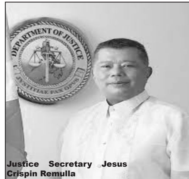
Justice Secretary Jesus Crispin Remulla