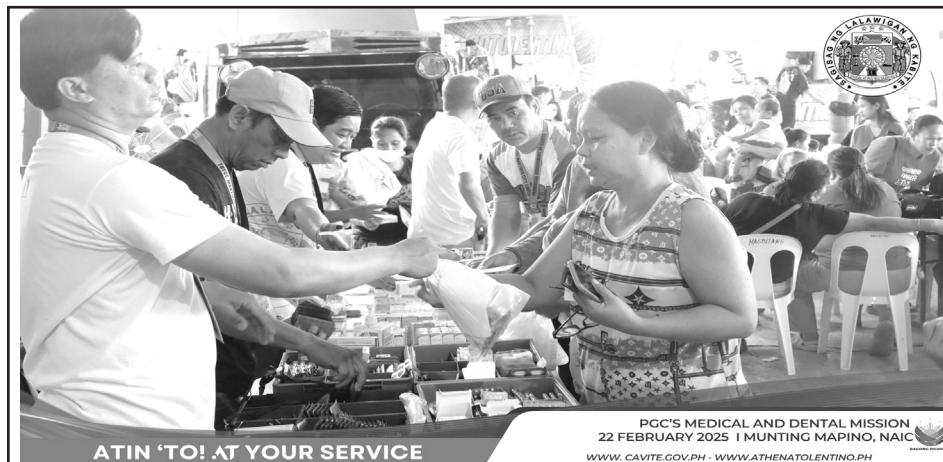
ATIN 'TO! AT YOUR SERVICE

Local officials expressed their gratitude for the initiative, highlighting its impact on residents who needed medical attention and support. --- OPIO