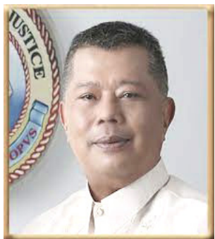
DOJ Sec. Jesus Crispin “Boying” Remulla cos Jr. announced the appointment of Abalos to head the DILG, and 10 days later, he named

MANILA – The Commission on Appointments (CA) on Wednesday confirmed two former local chief executives to lead the Department of Justice (DOJ) and the Department of the Interior and Local Government (DILG). Both DOJ Secretary Jesus Crispin “Boy-