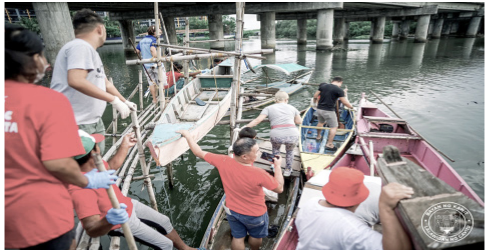
Municipality of Kawit joined hands with the International Coastal Cleanup 2022 led by our MENRO and MDRMO on September 17, 2022. Personnel's from different city government agencies are glad, we cleaned our riverside in Brgy. Pulvorista where some of our countrymen also fish. It is important that we keep our rivers and beaches clean for the betterment of our environment, and the well-being of our countrymen.