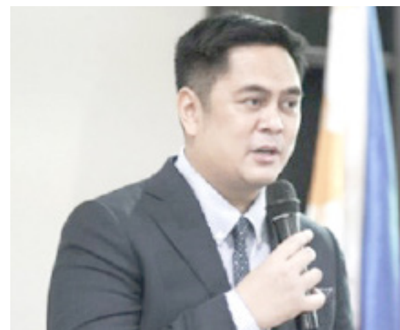
Communications Secretary Martin Andanar