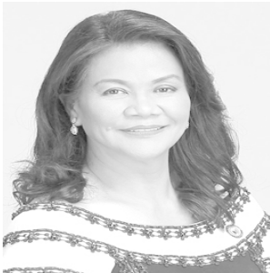
Rep. Dahlia Loyola