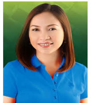
Mayor Jenny Austria-Barzaga