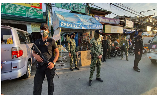
"The Bacoar city government has decided to extend the localized lockdown in Zapote 1 until July 24, citing the unabated increase of coronavirus cases in the barangay (village)."

If you see someone disobeying the Liquor Ban, inform PNP-Carmona immediately on the number (046) 430-0911 / 0998-598-5610 or in your barangay because we will intensify the catching of the said violators.