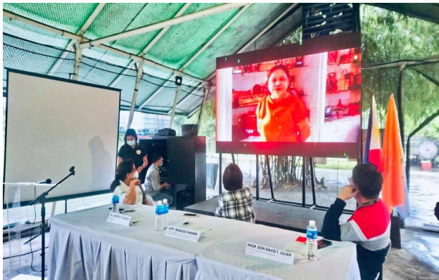
Opening ceremonies of "Training of Trainers on Production of High Quality Inbred Seeds and Farm Mechanization," graced by ATI in Calabarzon Cen-