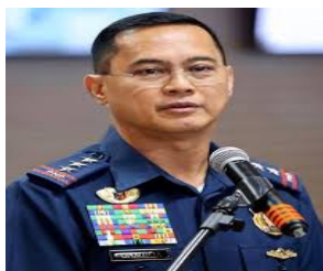
PNP chief Gen. Archie Gamboa

As of Monday evening, the PNP Health Service said out of the new cases, 130 are from the Police Re-