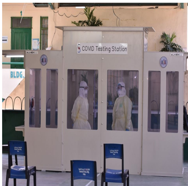
COVID-19 swab collection booths were set up in cities and municipalities with cases of the corona virus.

"Pray that we can make this possible for our kababayan," he said.