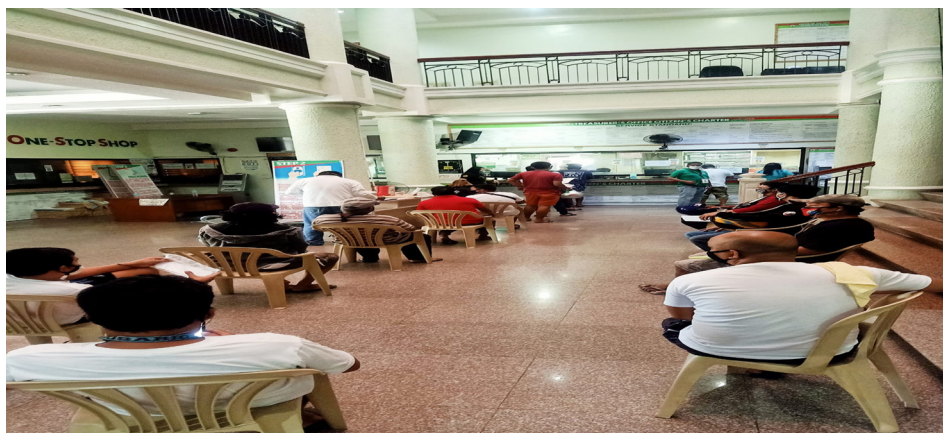
Pamamahagi ng Tulong Pinansyal sa mga Tricycle Drivers ng Lungsod ng General Trias.