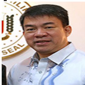
Senator Aquilino "Koko" Pimentel III

The Senator emphasized the benefits of Cont. on PAGE 4