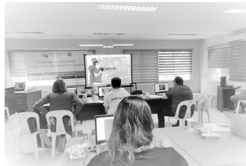
Ang mga kalahok ng Training on Quantum Geographic Information System habang nakikinig sa talakayan.

LUNGSOD NG TRECE MARTIRES - Ang Agricultural Training Institute CALABARZON sa pakikipagtulungan sa Kagawaran ng Pagsasaka CALABARZON at mga Tanggapan ng Panlalawigang Beterinaryo ng CALABARZON ay nagsagawa ng pitong (7) pangkat ng "Training on Quantum Geographic Information System" sa mga lalawigan ng Cavite, Laguna, Batangas, Rizal at Quezon. Ito ay ang pang-apat o panghuling aktibidad sa ilalalim ng prorama ng Bantay ASF (African Swine Fever) sa Barangay o BABay ASF sa ilalim ng Department of Agriculture National Livestock Program.