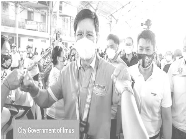
City Government of Imus

"Tuloy ang pag-sulong natin ng hangarin sa pagbubuklod ng mga lider ng bayan, para sa higit na pagseserbisyo at paglilingkod sa mga Caviteño at bawat pamilyang Pilipino," ani Mayor