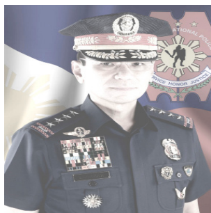
Chief PNP, POLICE GENERAL ELEAZAR

Earlier before he visited Cavite Police Provincial Office, The Chief PNP visited and conducted inspections at Kawit and Tanza Municipal Police Station as part of the Intensified Cleanliness