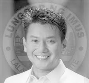
IMUS Mayor Emmanuel Maliksi

Binigyang pugay ni Imus City Mayor Emmanuel Maliksi ang pagbisita ni Senator Ping Lacson sa lungsod noong Biyernes,Nov. 5. Kasabay ng pagsibita, naging bahagi rin ng pag-pupulong kasama ang Cavite Mayor's League si Senator Lacson.