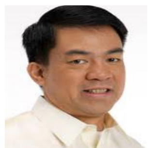
Senator Koko Pimentel

In a press statement, Senator Pimentel admitted