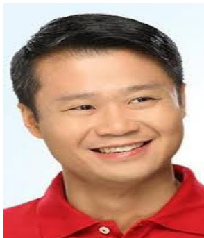
Senator Sherwin Gatchalian