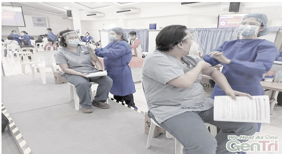
GEN. TRIAS: Vaccination for 281 Frontline Health Workers of the 1st dose of Astra-Zenica COVID-19 Vaccine held at Divine Grace Medical Center partner with Department of Health and City Health Office co last April 3. At the same time the City Government of General Trias also provided Vitamin C with Zinc.