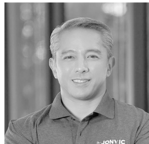
Gov. Jonvic Remulla

Patuloy naman ang DOH 4A sa pagbibigay ng paalala sa publiko na palagiang sundin ang minimum health protocols upang mapigilan ang pagkalat ng COVID-19. (FSC)