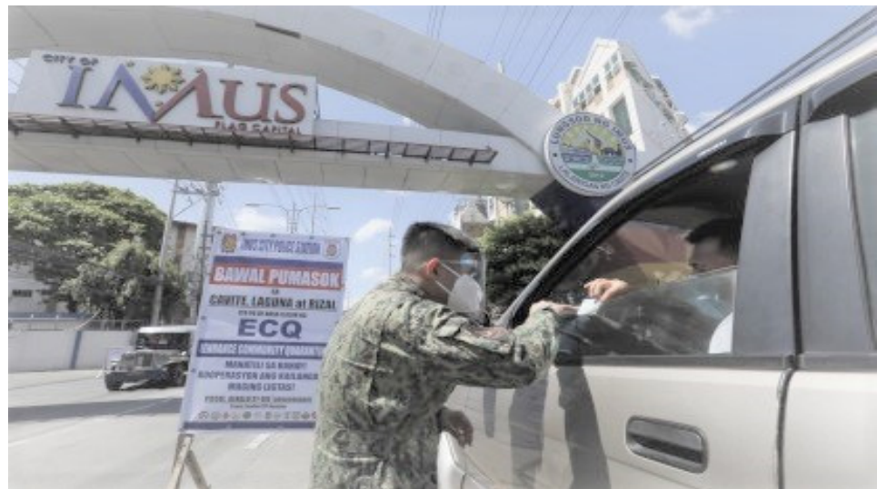
Imus boundary checkpoint

By staying safe at home, we help save lives.