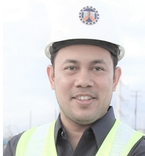
Secretary Mark A. Villar 8th Avenue already relocated.

Construction of retaining and MSE wall for the 155 meter approach 3 are also on-going with the underground utilities of Meralco along