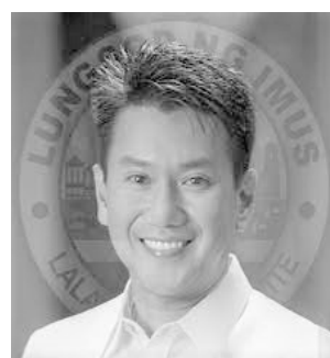
IMUS Mayor Emmanuel Maliksi