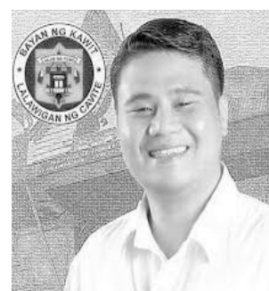
KAWIT Mayor Angelo Aguinaldo