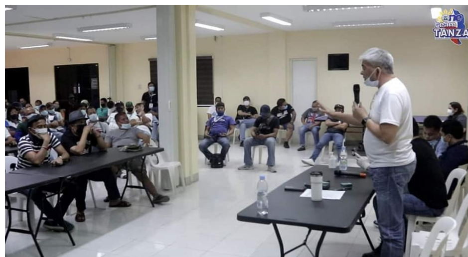
Pulong ng lokal na pamahalaan ng Tanza sa mga kapitan ng 41 barangays kaugnay sa ipatutupad na GCQ sa Sabado.

There were several batches of Bacooreño returnees that had been assisted by the local government since the start of May 2020. (Ruel Francisco, PIA-Cavite with reports from the official FB page of Bacoor Tourism Office)