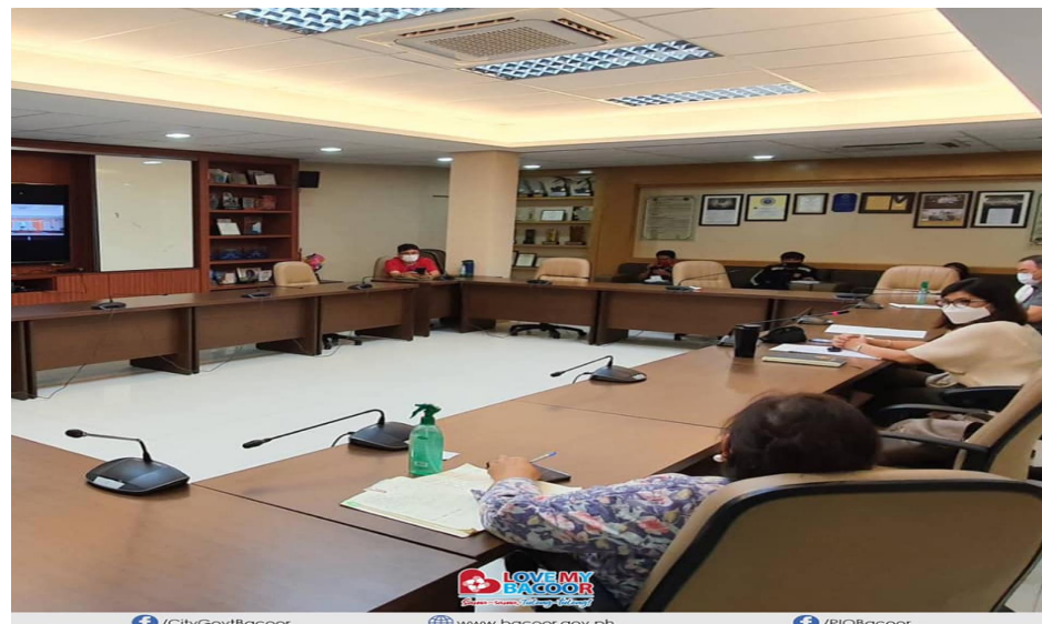
Nagsagawa ang CDRMMC ng emergency meeting para pag-usapan ang mga paghahanda para sa Typhoon Ambo. Ibayong pag-iingat ang ipinapaalala sa lahat para makaiwas sa anumang pinsala na maaring idulot ng Typhoon Ambo.

Although he has his residence at the Congregation, Cardinal Tagle has been staying at the Collegio since his arrival in Rome in February. He travels to his office at Piazza Spagna daily despite the pandemic.