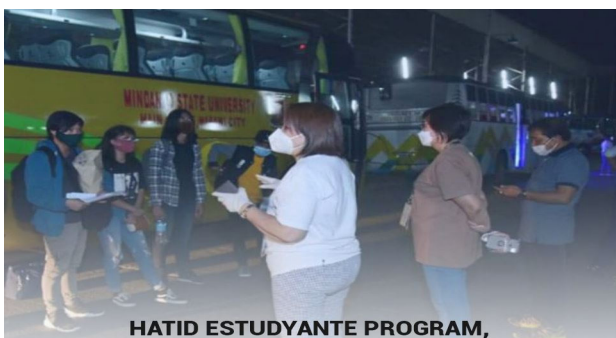
HATID ESTUDYANTE PROGRAM, IPAPATUPAD NG PAMAHALAAN

Mga estudyanteng nais umuwi sa probinsya, tutulungan ng gobyerno sa "Hatid Estudyante Program" sa papamagitan ng riles, barko, bus, at eroplano.