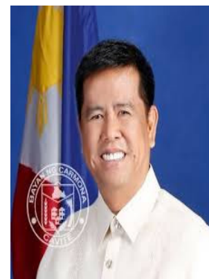
MAYOR ROY LOYOLA

Target beneficiaries are families who were not granted with cash subsidy