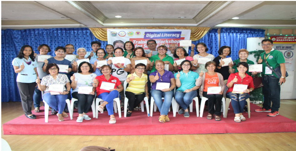
Training-Workshop for Senior Citizens on Canva Application facilitated by our Imus City Public Library on last November 12, 2019 at Imus City Public Library

The Palace directive calls for faster rehabilitation and restoration of the coastal and marine ecosystem of the Manila Bay, which is known for its breathtaking sunset.