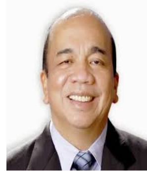
Cavite 4th district Rep. Elpidio Barzaga

The chairman of the House Committee on Environment and Natural Resources told the Manila Bay Task Force to rid the Manila Bay coast of illegal structures built by informal settlers, or else it will never complete its objective of cleaning it.