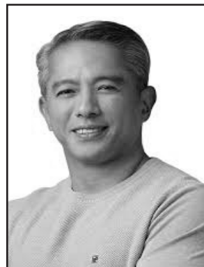
DILG SECRETARY JONVIC REMULLA

The AICS program assists with burial, medical, food, and transportation needs, including help in paying hospital bills through the issuance of guarantee letters (GLs). The maximum amount of cash assistance given is Php 10,000, depending on the assessment of the social worker, and it can be exceeded through the issuance of a guarantee letter. (GLDG/PIA-NCR)