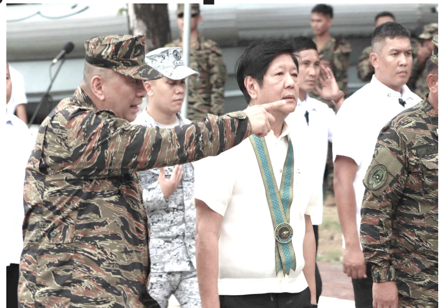
President Ferdinand R. Marcos Jr. graced the 67th anniversary of the Philippine Navy Naval Special Operations Command at the NAVSOCOM Headquarters, Naval Base Heracleo Alano, Sangley Point, Cavite City on November 6, Monday.

The NAVSO-COM serves as a special operations unit of the PN that specializes in SEAL operations. These range from reconnaissance, close combat, demolition, intelligence and underwater operations in support of overall naval operations./PIA