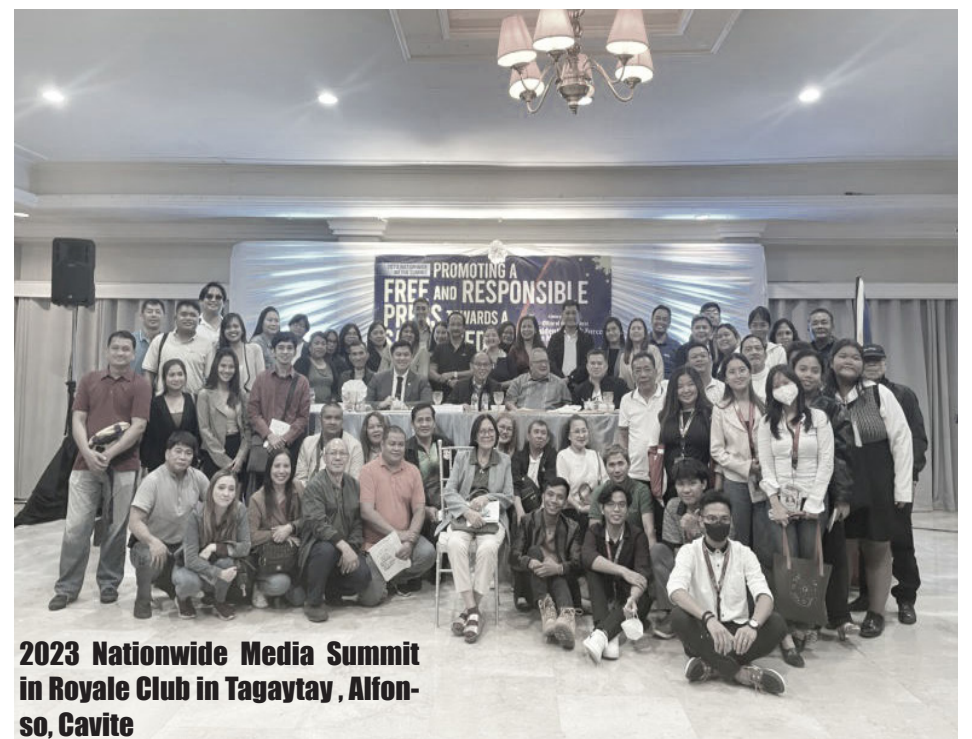
2023 Nationwide Media Summit in Royale Club in Tagaytay, Alfonso, Cavite

PTFoMS is created by virtue of Administrative Order (AO) No. 01 "Creating the Presidential Cont.on PAGE6