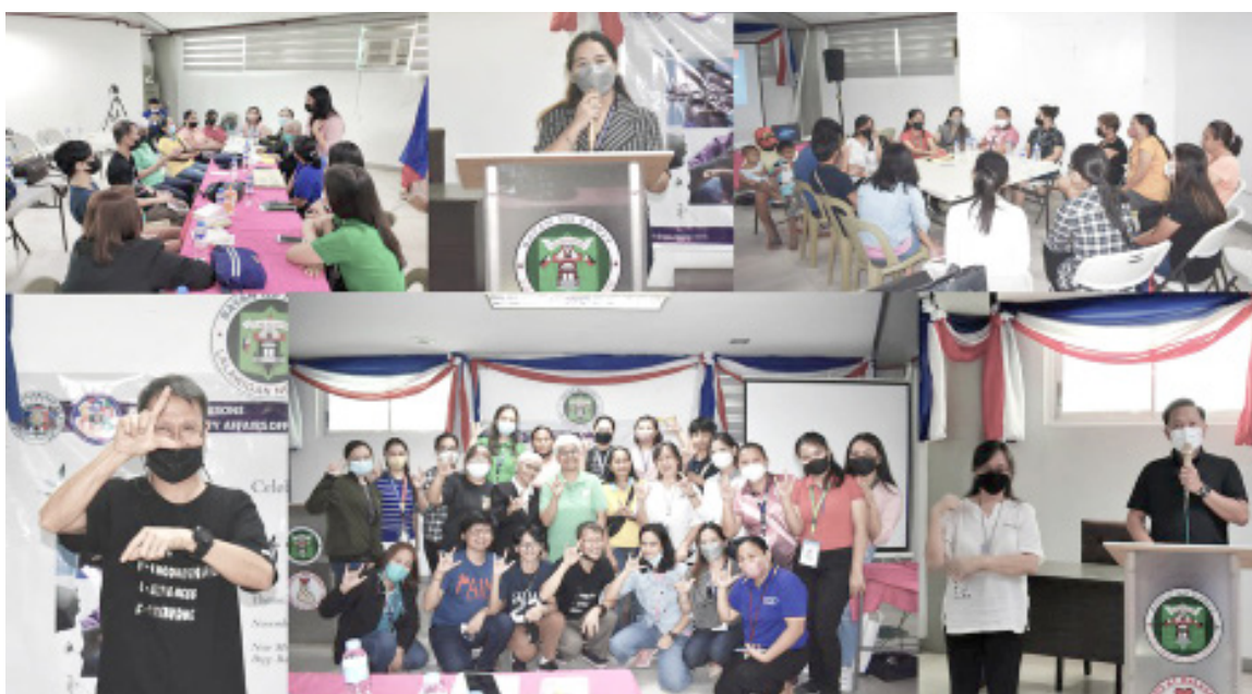
Celebration of Deaf Awareness Week with the theme, DEAFusion: Bridging the Gap, the Provincial Government of Cavite through the Persons with Disability Affairs Office held at the Conference Room of the new Municipal Building in Kawit, Cavite on Nov. 16.

Partner agencies for the inclusion and empowerment inter-agency exploratory meeting for the deaf community were DOLE, PESO, PCLEDO, TESDA, PYS-DO, PHO, DILG, DepEd, HAPPY HOMES HC, and CvSU GADRC.--- AC Cabrera