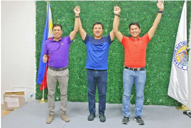
MAYOR MANNY MALIKSI, VICE MAYOR ONY CANTIMBUHAN AND CONGRESSMAN AA ADVINCULA AND OTHER ELECTED OFFICIALS