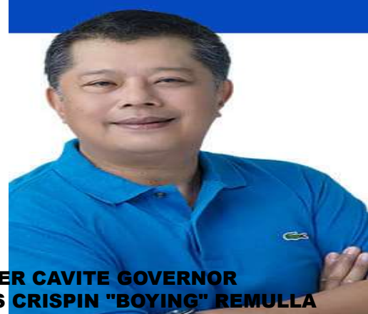
FORMER CAVITE GOVERNOR JESUS CRISPIN "BOYING" REMULLA