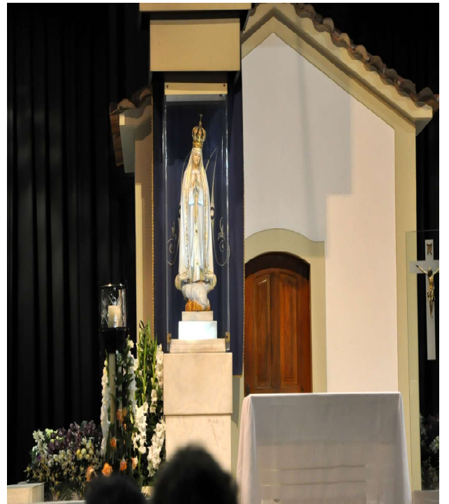
FILE: The image of Our Lady of Fátima in the Chapel of the Apparitions.

Aleteia added: “This particular part of the apparition tends to be the most distressing. It appears that God may strike us all down with a “flaming sword.” However, Cardinal Ratzinger makes the point that the “flaming sword” would be something that we create (like the atomic bomb) as opposed to any fire that comes down from heaven. The good news is that the vision records the flaming sword “died out in contact with the splendor [of] Our Lady” in connection to the call of “Penance, Penance, Penance”. The Blessed Mother has the