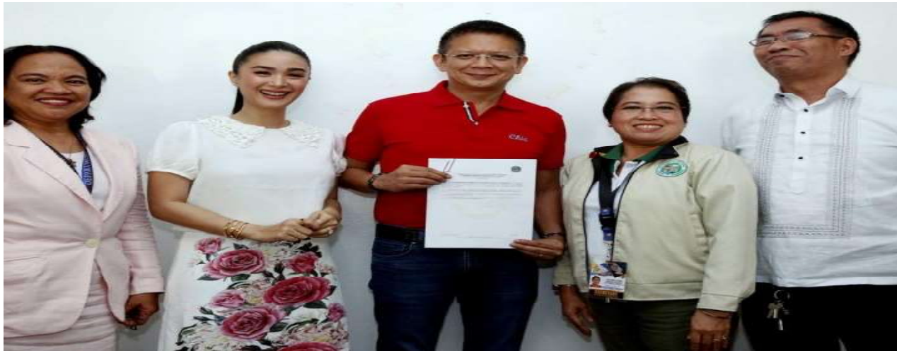
Sorsogon Governor-elect Francis 'Chiz' Escudero with his wife, Heart Evangelista and the members of the provincial board of canvassers of Sorsogon.