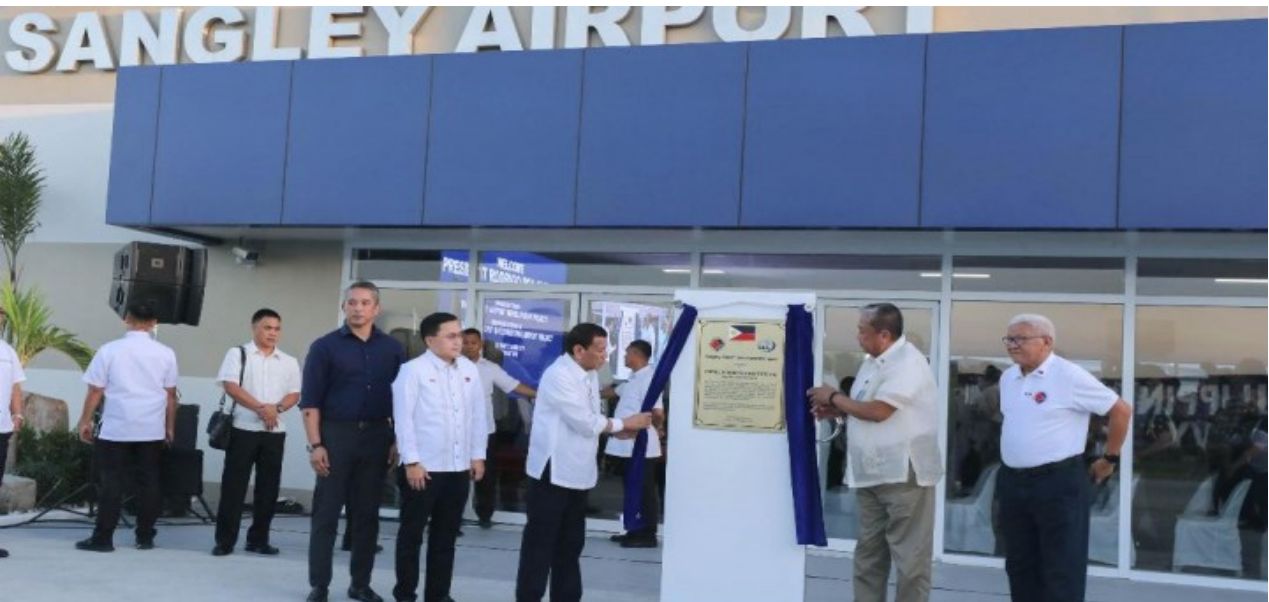
SANGLEY AIRPORT. President Rodrigo Duterte leads the unveiling of the Sangley airport's marker and presentation of the Sangley Point International Airport (SPIA) Project at the New Passenger Terminal Building (NPTB), Sangley Airport in Cavite City, Cavite on Saturday (Feb. 15, 2020) with Cavite Gov. Jonvic Remulla, Sen Bong Go, Sec Art Tugade and other officials. SPIA project shall serve as a global aviation hub to decongest the Ninoy Aquino International Airport.

Prospective bidders/buyers are hereby enjoined to investigate for themselves the title to the said property and