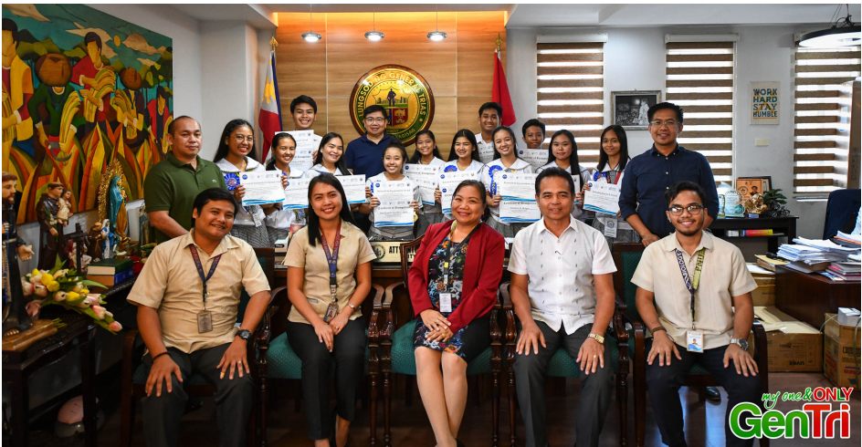
CONGRATULATIONS! General Trias Delegates for winning in the recently concluded National Science and Engineering Fair.