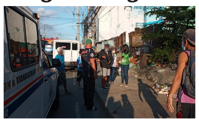
The Bacoor Disaster Risk Reduction and Management Office together with CSWDO and Pnp Bacoor conducted "Sagip, Batang Lansangan" at Brgys. The Street Children was later turned over to their parents and others were turned over at their respective barangays.

MANILA – The Senate on Monday approved on third and final reading a bill that seeks to provide a network of safe pathways for those who prefer to walk, bike, or use other non-motorized vehicles to their regular destinations.