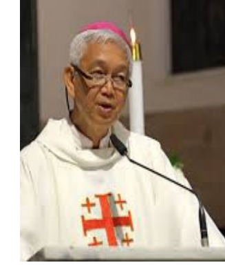
Bishop Broderick Pabillo

"We thank Bishop Pabillo and the leaders of the Church for offering us the cathedral as a vaccination site. Napakahalaga nito because we need inocula-