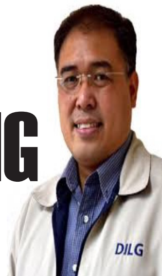
DILG Undersecretary Epimaco V. Densing III

The CALABARZON Balik Probinsiya, Bagong Pag-Asa (BP2) Committee endorsed the BP2 Action Plan to the Regional Development Council (RDC) during its meeting on November 19, 2020. The meeting which was chaired by DILG Undersecretary Epimaco V. Densing III also approved the creation of the Regional BP2 Communication Group to take the lead in the information campaign.