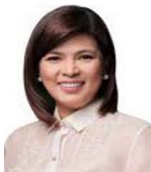
Mayor Lani Mercado Revilla line Application for business permits and building permits. Online Appointment

The City Government launched the Bacoor One Stop Shop. Mayor Lani Mercado Revilla said, "This is the program many of our countrymen are looking forward to. By doing online transactions, getting permits and taxes will be easy, fast, and safe for our countrymen. Apart from that, we can step up the implementation of social distancing protocol at City Hall."