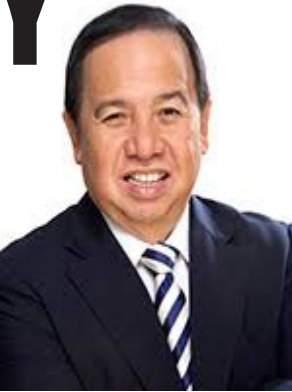
Senator Richard Gordon

Hungarian Foreign Minister Peter Szijjarto said his government has proposed a USD30-million assistance to the Philippine government for the rehabilitation and water treatment of Laguna Lake. He added a formal offer was made during his bilateral meeting with Locsin.