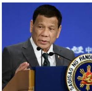
President Rodrigo Roa Duterte

are acting as the bar so that people cannot go back to their lands and places because it's dangerous," the President said.