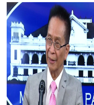
Presidential Spokesperson Salvador Panelo

LGUs should also post public advisories about the coronavirus as well as precautionary measures that the public can take such as maintaining proper hygiene and regular handwashing. "Local health authorities doing frontline work must exercise extreme vigilance in handling suspected individuals and strictly monitor those possibly infected," he said. (PIANC)