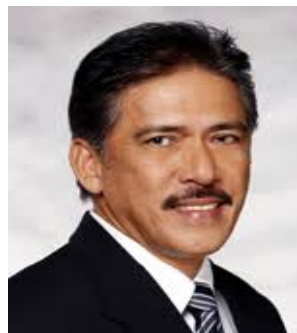
SENATE President Vicente C. Sotto III

"Ang daming kumakalat na fake news ngayon na dumadagdag lang sa public panic. During this time when our country needs to deal with