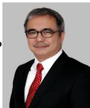
DOST Secretary Fortunato de la Peña

Secretary de la Peña emphasized the importance of friendship in the ASEAN and reminded scholars that they have a mission to fulfill.