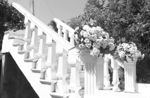
What was left of Brigadier General Vicente Lim's ancestral property in Calamba is the staircase of their home, where the general's love for country started at a young age of 14.