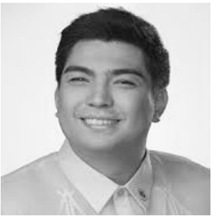
1st District Congressman Jolo Revilla

Nanguna si 1st District Congressman Jolo Revilla bilang Top Performing District Representative sa CALABARZON. Sa latest survey ng RP-Mission and Development Foundation (RPMDF) ang resulta ng isinagawa nitong "Boses ng Bayan: Annual Performance Report for 2023" mula Disyembre 27,2023 hanggang Enero 5, 2024 kung saan lumabas na nanguna si Cong. Jolo Revilla na nakakuha ng 92.3% performance score base sa mga proyekto, programa, at panukalang