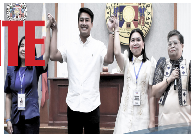
ATIN 'TO! AT YOUR SERVICE Gov. elect Abeng Remulla with Provincial Board of Canvassers.