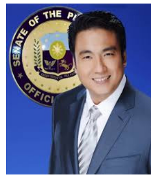
Sen. Bong Revilla

He also pointed out that kind of arrangement is recognized by DOLE through Department Advisory No. 2, "Guidelines on the Doption of Flexible