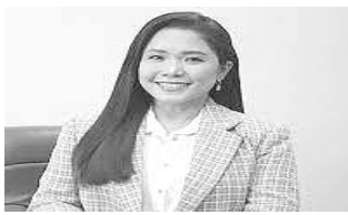
TMC Mayor Gamma Lubigan