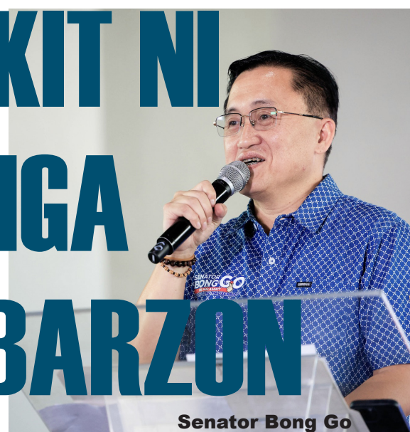
Senator Bong Go