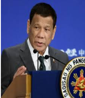
Pres. Rodrigo Duterte

"Una, ang reklamo ko na — iyong mga Pilipino na