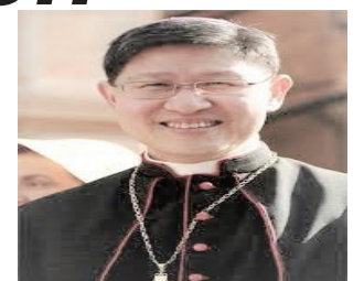
Archbishop Emeritus Luis Antonio Cardinal Tagle