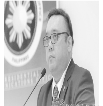
Secretary Harry Roque Jr

Presidential Spokesperson Secretary Harry Roque Jr on Tuesday, March 23, reiterated that the current additional restriction measures that include the placing of the National Capital Region (NCR) and the provinces of Bulacan, Cavite, Laguna, and Rizal inside a bubble is not a form of lockdown.