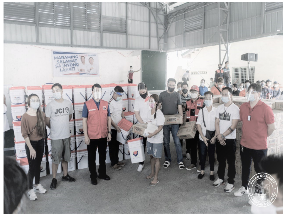
The Kawit LGU and other government executives helped victims of the recent fire in Barangay Samala-Marquez. Story p4