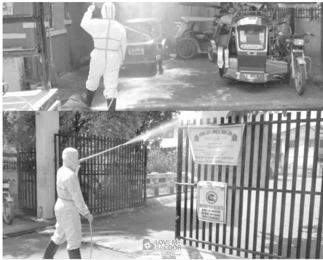
CENRO BACOR staff are continuously carrying out disinfection operations in different corners of the city. Recently they went to Mambog I and III to keep these areas clean.