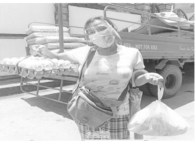
Up-to-date assistance received by registered fishermen in Bacoor City on March 23. Aside from financial assistance, they also received rice, chicken, and eggs under the leadership of the Department of Agriculture-Bureau of Fisheries and Aquatic Resources and Bacoor City Agriculture Office.