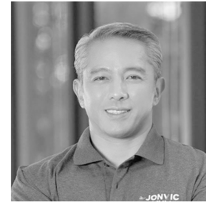
Gov. Jonvic Remulla

Pob. 1 & 2 in Amadeo was just 2 out of the 50 barangays selected by DTI Cavite to undergo LSP-NSB program for 2021.