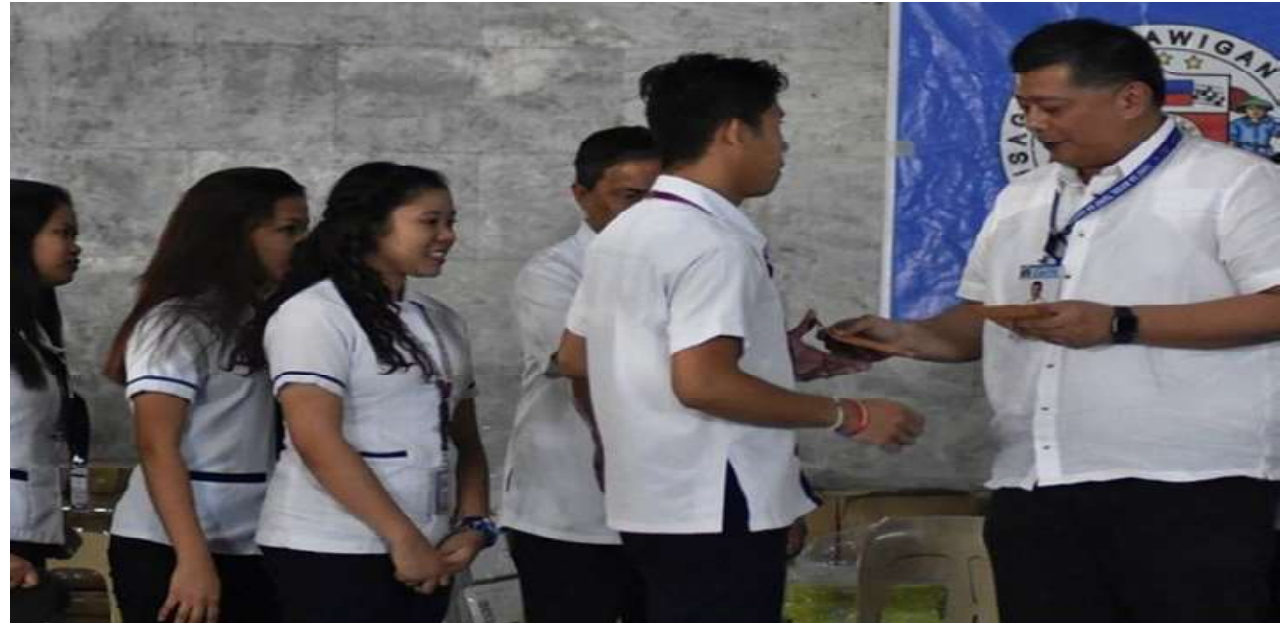
Sulong Dunong Programs: Cavite Governor Boying Remulla personally led the distribution of financial assistance to student beneficiaries in the towns of Tanza and Rosario