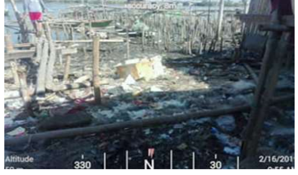
Barangay Maliksi III's polluted river and its environs in Bacoor City, Cavite is among the areas that will undergo a massive cleanup on March 1.

Hope to see you! Don't miss this chance.