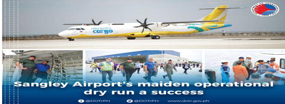
The Sangley Airport has successfully commenced its operational dry run today, 29 October 2019.

During the dry run, Sangley Airport welcomed without a hitch its maiden cargo flight – an ATR 72-500 cargo freighter from Cebu Pacific operated by CebGo. Department of Transportation (DOTr) Secretary Arthur Tugade witnessed the arrival of the maiden flight, together with Cavite Governor Jonvic Remulla and officials from the DOTr, its attached agencies, Philippine Air Force, and the Philippine Navy. Following the freighter's landing, Secretary Tugade announced that the full dry run will be concluded in seven (7) days, after which an inauguration will be held in the coming days to formalize the opening of the Sangley Airport. "The dry run will be finished in seven days. After seven days, it will be operational