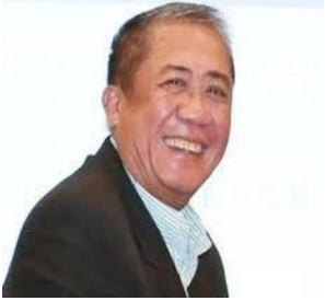
Secretary Arthur Tugade

galang at magbibigay pugay tayo sa Office of the President at Office of the Executive Secretary at sasabihin sa kanila, 'Sir, handa na 'ho 'yung Sangley Airport, i-inaugurate niyo na', Secretary Tugade expressed. TURN TO PAGE 4