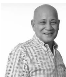
Cavite City Mayor Bernardo "Totie" Paredes