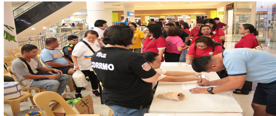
CITY GOVERNMENT OF IMUS: hBloodletting activity noong Oktubre 30 sa Robinsons Place Imus.