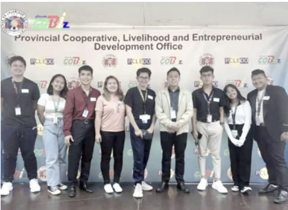
2023 CAVITE ENTREPRENEURSHIP STUDENTS CONFERENCE LAST NOV. 29, 2023 via Zoom (Story on page 5.)