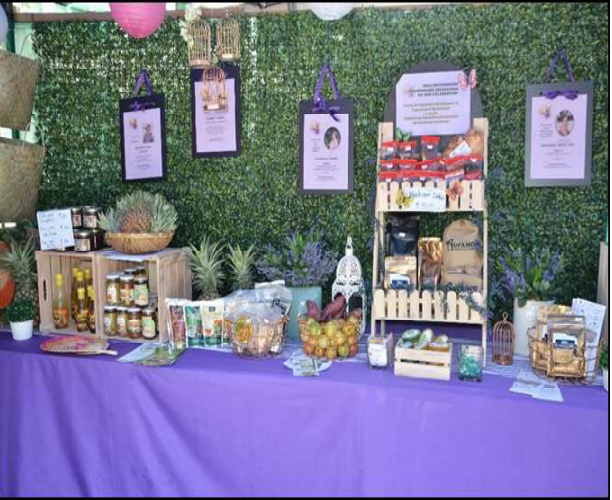
Product showcase at the Calabarzon booth, produced by the Department of Agrarian Reform (DAR) beneficiaries of mostly women farmers from the provinces of Cavite, Laguna, Batangas, Rizal and Quezon during the five-day agri-trade expo in Quezon City LAST March 25 to 29, 2019.

and municipalities with the most number of dengue cases in Calabarzon include Dasmariñas with 339; Lipa City with 276; Bacoor with 261; Batangas City with 255; Calamba City with 239; Imus with 218; Lopez with 217; San Pablo City with 203; Tanauan City with 176; and General Trias with 171. “We are already making rounds in the provinces to ensure that Dengue Fast Lanes are established and functional in all hospitals, and also to ensure that Dengue NS1-RDT are available to all health centers and public hospitals to be used for the early detection of dengue disease,” Janairo said. The Dengue NS1-RDT is one of the tests used to classify dengue according to the severity of its signs and symptoms. He also urged the public to practice the 4S-Strategy in all levels — search and destroy mosquito breeding sites, secure self-protection, seek early consultation and support fogging or spraying to prevent an impending outbreak.source: ByGO CAVITEP