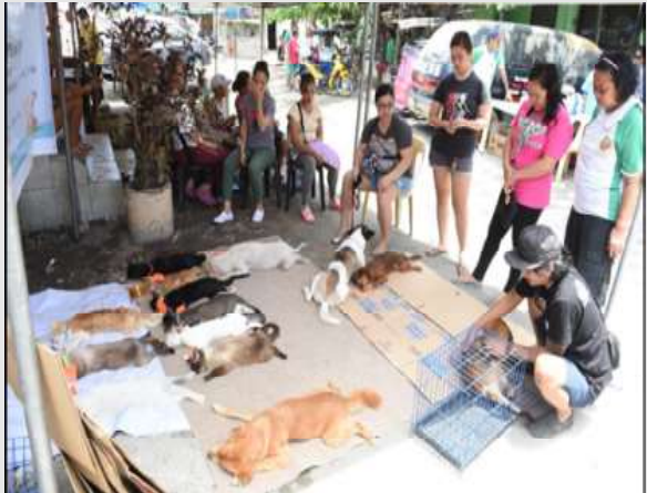
Pet owners wait patiently as their dogs and cats undergo spaying and castration by a team of veterinarians from the Department of Health (DOH) Calabarzon regional office and Cavite City Veterinary Office in Barangay 29-A Multi Purpose Hall, Ronquillo Caridad in Cavite City on April 4, 2019.