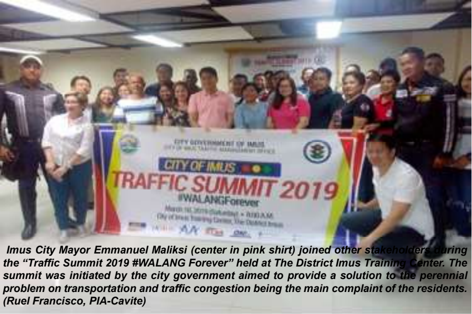
Imus City Mayor Emmanuel Maliksi (center in pink shirt) joined other stakeholders during the “Traffic Summit 2019 #WALANG Forever” held at The District Imus Training Center. The summit was initiated by the city government aimed to provide a solution to the perennial problem on transportation and traffic congestion being the main complaint of the residents.

Based on a survey, illegally parked vehicles along the road, sidewalks used by vendors, tricycles plying the main thoroughfares, undisciplined crossing of pedestrians, unauthorized loading and unloading zones, and the unsystematic manual intervening of traffic aides especially during the rush hours were all identified as contributing factors to traffic congestion.