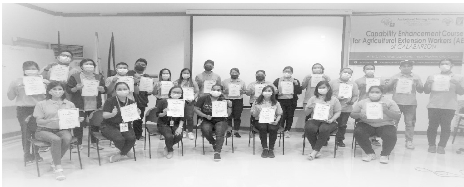
Ang mga kalahok na nagsipagtapos mula sa Capability Enhancement Course for Agricultural Extension Workers (AEWs).

TRECE MARTIRES CITY, Cavite - Matagumpay na naisagawa ang unang batch ng "Capability Enhancement Course for Agricultural Extension Workers (AEWs)" noong ika-12 hanggang ika-16 ng Hulyo, 2021 sa sentrong pasanayan ng Agricultural Training Institute (ATI) CALABARZON sa Trece Martires City, Cavite. Ito ay sa pangunguna ng ATI CALABARZON katuwang ang Philippine Rice Research Institute (PhilRice) Los Baños at Department of Agriculture Regional Field Office (DA RFO) IV-A. Dalawampung (20) rice AEWs, DA RFO IV-A rice coordinators at mga kawani ng PhilRice Los Baños ang nagsipagtapos sa limang araw na pagsasanay.