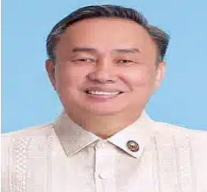
Rep. Abraham "Bumble" N. Tolentino

Tagaytay City joins the celebration of National Disability Prevention and Rehabilitation Week on July 20.