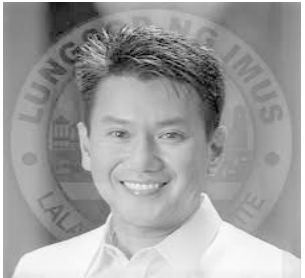
Mayor Emmanuel Maliksi

for the safety of ourselves, and our families," said Mayor on his Facebook page.