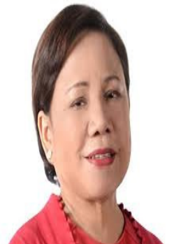
Senator Cynthia Villar

rin tugma ang reclamation project sa isinasagawang Manila Bay rehabilitation project ng pamahalaang nasyonal.