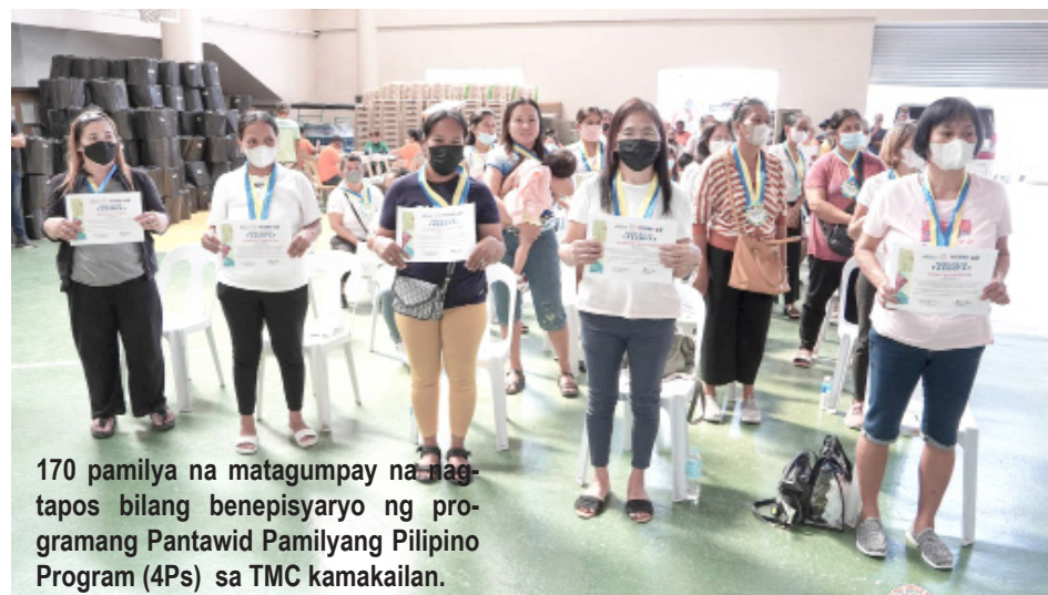
170 pamilya na matagumpay na nagtapos bilang benepisyaryo ng programang Pantawid Pamilyang Pilipino Program (4Ps) sa TMC kamakailan.