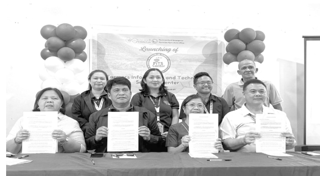
Signing of new FITS Center in Cardona, Rizal

bayan. Sa pamamagitan ng mga FITS Centers, mas nagiging abot-kamay ang kaalaman at serbisyong makatutulong sa mas maunlad at mas matatag na agrikultura sa Rizal.