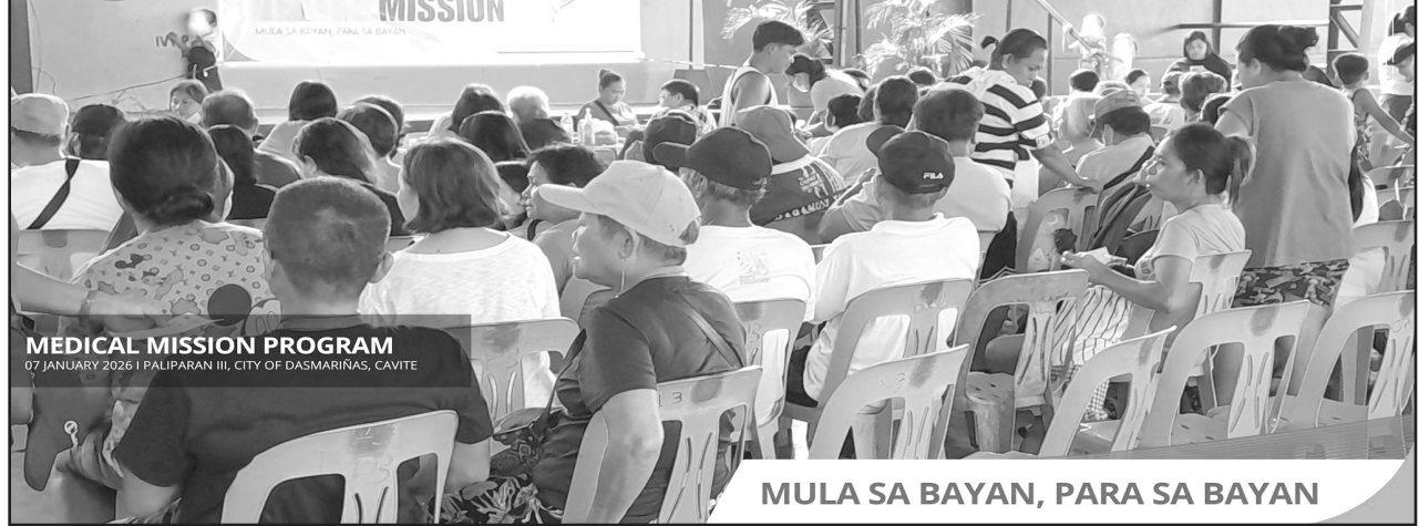
MEDICAL MISSION PROGRAM 07 JANUARY 2026 | PALIPARAN III, CITY OF DASMARIÑAS, CAVITE