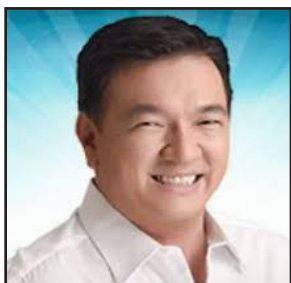
Mayor Strike Revilla

BACOR CITY Mayor Strike B reminded again. Revilla to parents, teenagers, and Barangay Officials in Bacoor City regarding the implemented Curfew Hours for Minors starting 10pm to 4am.