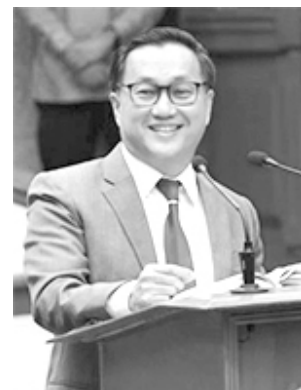
Senator Francis Tolentino

'KLABARZON' which stands for "Kabite, Laguna, Batangas, Rizal, and Quezon" will focus achieving economic growth, better quality of education, as well promoting sustainable regional tourism, cultural heritage and environmental awareness and protection within the boundaries of the