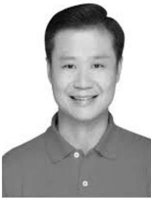
Senator Win Gatchalian

"Malinaw na suportado ng ating mga kababayan ang ating panukala na ipagbawal ang paggamit ng mga cellphones sa mga paaralan, lalo't na't ang paggamit nito sa oras ng klase ay maaaring makapinsala sa kanilang pag-aaral. Kaya