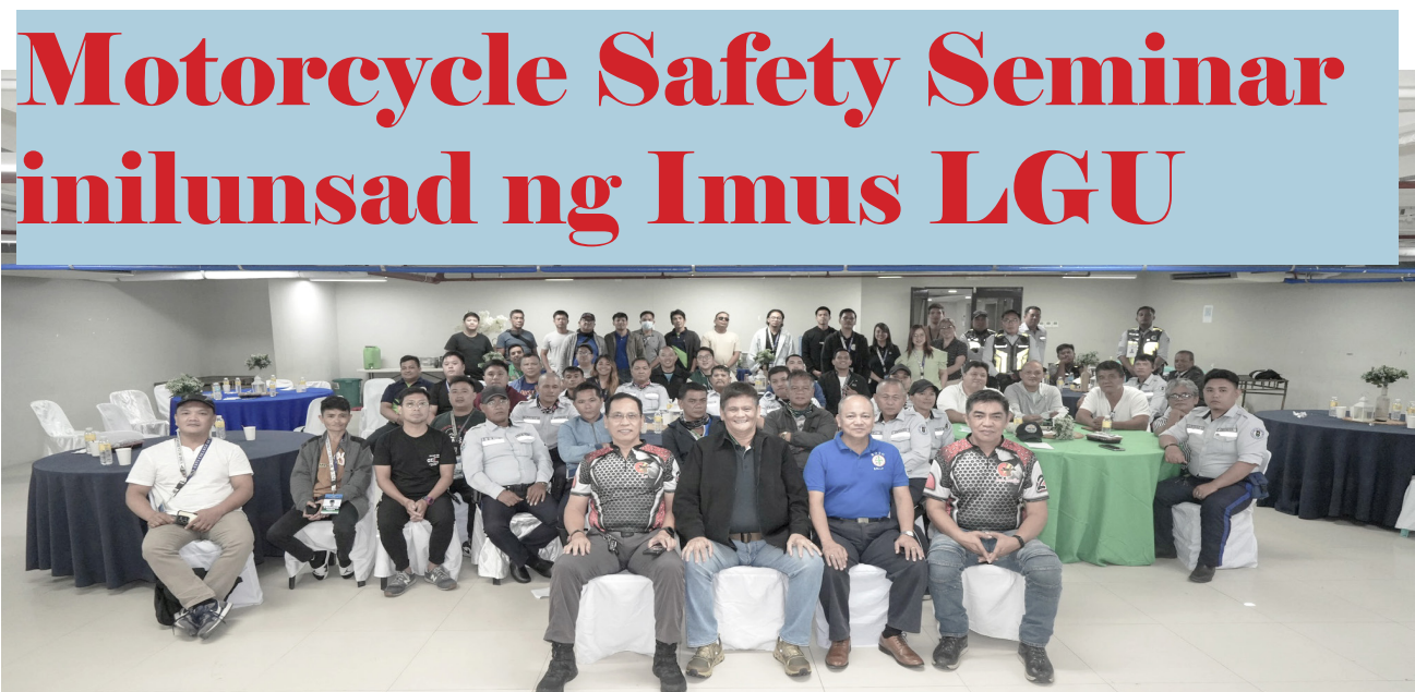
Inilunsad ng City of Imus Traffic Management Unit (CITMU) ang Motorcycle Safety Seminar noong Huwebes, Agosto 8, at Biyernes, Agosto 9, 2024, sa Wellness Center ng New Imus City Government Center. Dinaluhan ito ng 56 na CITMU personnel at 48 kawani ng Pamahalaang Lungsod ng Imus na nagmamaneho