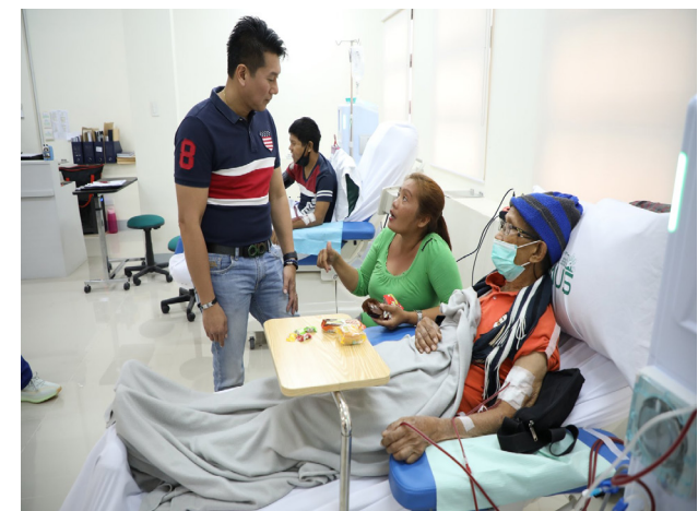
Inauguration and Blessing of Ospital ng Imus Dialysis Center - January 16, 2020 at Ospital ng Imus