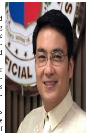
Sen. Bong Revilla