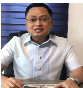
Vice Mayor Aidel Belamide