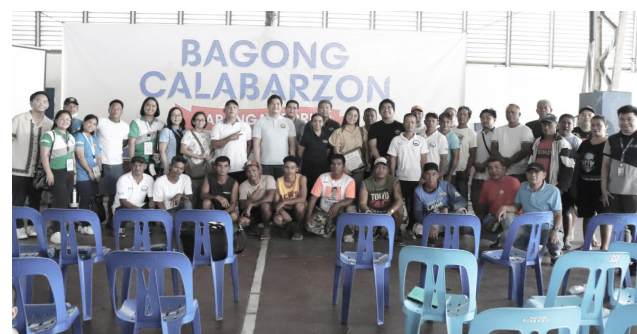
Philippine Information Agency (PIA) IV-A has formally launched "Bagong Calabarzon Barangay Forum", inaugural program held in Barangay Palingon, Calamba City, Laguna recently.

The Bagong Calabarzon Barangay Forum is in line with the Bagong Pilipinas campaign of President Ferdinand R. Marcos Jr. which serves as the National Government's branding and communications strategy.