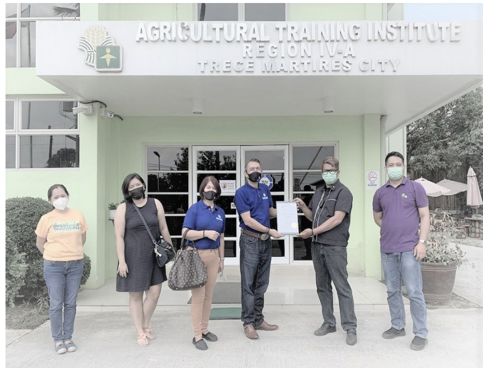
Awarding of certificate to D'Constantinos Farm Corp. located in Maragondon, Cavite as new Learning Site for Agriculture (LSA) of ATI CALABARZON last May 26, 2021.