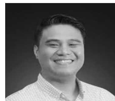
Municipal Mayor Angelo Aguinaldo

KAWIT, Cavite (PIA) -- Municipal Mayor Angelo Aguinaldo recently announced he will sell his favorite vintage car, a 1969 Dodge Charger R/T thru auction.