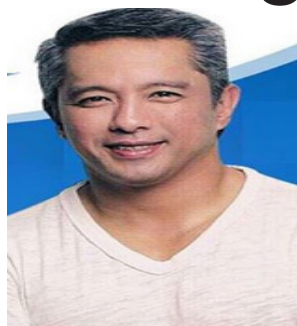
Governor Jonvic Remulla

final approval from the Department of Health (DOH) for the Cavite/DLSM-Center for Disease Control (CDC) laboratory's Level 5 accreditation, Gov. Remul-