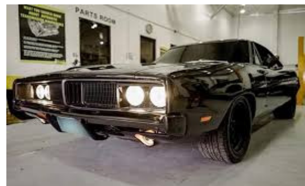
Mayor Angelo Aguinaldo's vintage 1969 Dodge Charger R/T is up for auction to raise funds for the town's COVID-19 response and to help Kawiteños particularly the senior citizens.

This is part of National Government programs now that we are under Enhanced Community Quarantine caused by COVID-19.