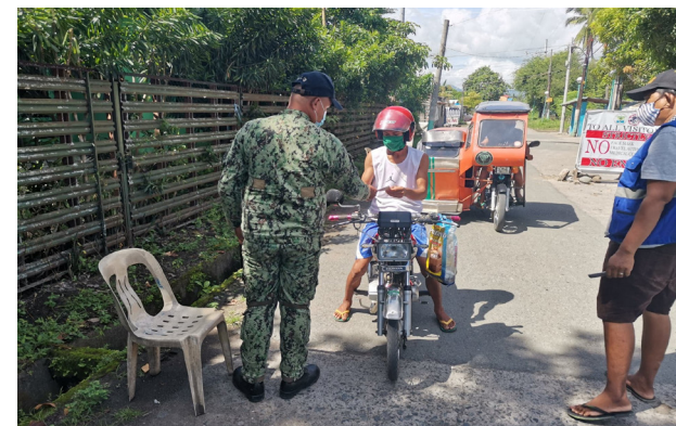
Personnel of Ternate MPS conducted distribution of Flyers re COVID-19 at the Checkpoint Area located at Brgy. Pob 1A and San Juan 1 Ternate, Cavite - August 3, 2020.