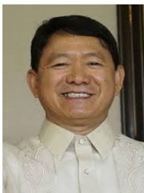
DILG Secretary Eduardo Año

"Dahil sa prohibisyon ng mass transportation sa ilalim ng MECQ, pinayagan na ang motorcycle backriding