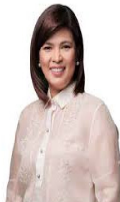
Mayor Lani Mercado-Revilla