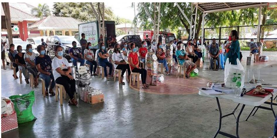
DTI distributed starter kits to 20 beneficiaries in Amadeo and 35 beneficiaries in Magallanes, Cavite.