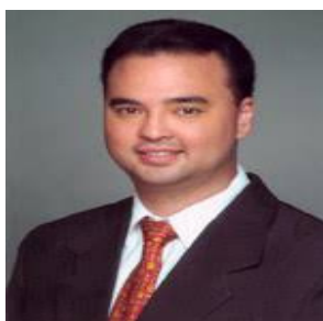
Speaker Alan Peter Cayetano

The House Ways and Means Committee approved on Monday a substitute bill to the proposed Puhunan, Tulungan, Kaunlaran (PTK) Act, which aims to provide MSMEs easier access to credit through a loan program with simplified processes and low interests.