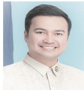
House Speaker Lord Allan Velasco

During a virtual hearing on Friday, the House Committee on Suffrage and Electoral Reforms approved House Bill 10261, which is authored by Speaker Lord Allan Velasco, Majority Leader Ferdinand Martin Romualdez, and Minority Leader Joseph Stephen Paduano.