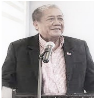
Sec. Art Tugade

DOTr Sec. Tugade leads the inspection of the project's Lucena Station